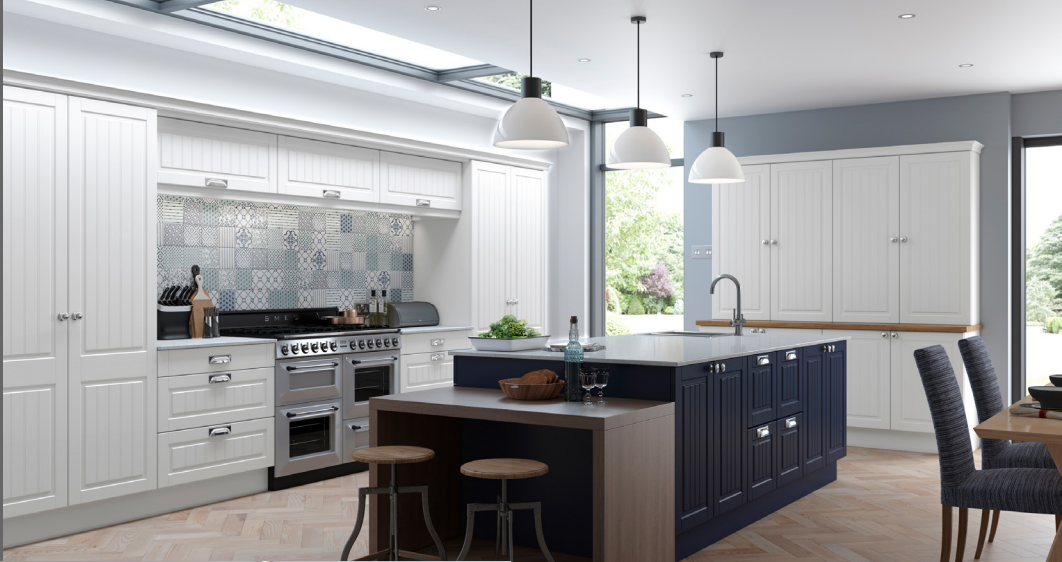
Matrix 5G Our most versatile range of doors boasting 20 different door styles and 70 different finishes