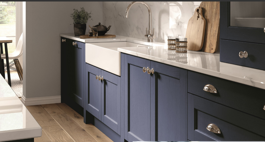
Buckminster A Trio of 22mm thick, 5-piece shaker doors offering a traditional, handmade aesthetic with true flexibility of design